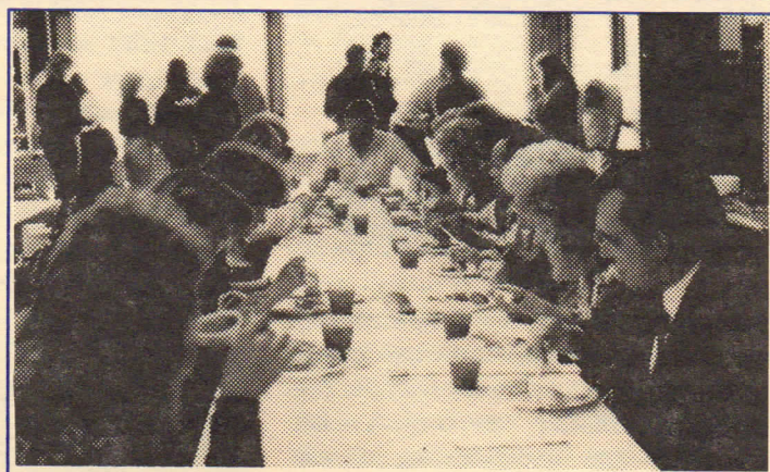
Above: Employees and guests sit down to celebrate Thanksgiving with a traditional turkey dinner